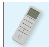
Optima 6 Channel Transmitter