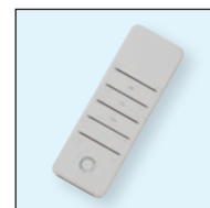
Optima 1 Channel Transmitter

Transmitters are powered by a 3 Volt Lithium button battery.