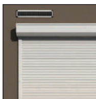
Unit to Wall*

* SolarSmart Plus units are only to be positioned on or above the roller shutter if in direct sunlight and facing north, with a minimum of half a day of sunlight in both Summer and Winter. Otherwise for optimum performance, SolarSmart Plus units should be positioned on the roof in direct sunlight and facing north where possible. If not enough direct sunlight, you may need to move the SolarSmart Plus unit to a north facing or ideal position, with available extension cables.