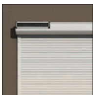
Unit to Pelmet*