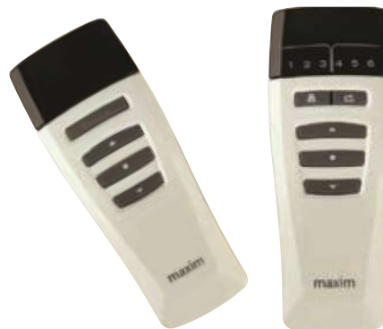
1 Channel Transmitter

The SolarSmart™ system incorporates the stylish CW Maxim Radio Transmitter and is available in both 1 Channel and 6 Channel options.